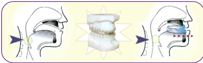
An appliance that opens the throat prevents airway obstruction.

If you or someone you know has a sleep disorder, let's discuss it. Perhaps we can learn together about how to manage this problem.